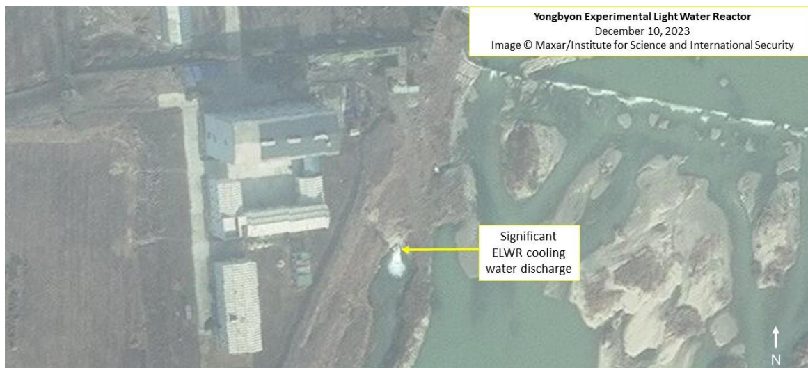
Figure 2. A December 10, 2023, image shows significant water outflow at the ELWR cooling water discharge point.

While the water outflow is consistently visible, the amount of outflowing water does not appear to have been consistent in volume, with some dates showing water gushing out of the discharge point in a wide stream, and others showing a thinner stream, albeit still significant. The widest water stream was noted on December 10, 2023 (see Figure 2). Imagery from just ten days later on December 20, 2023, shows an outflow that is half as wide.