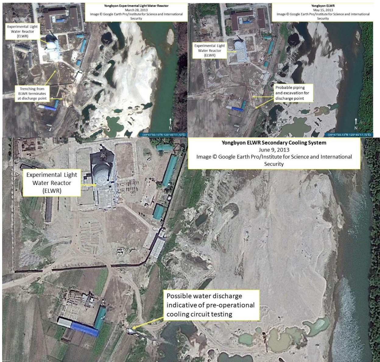
Figure 4. Trenching and excavation activities in 2013 show that the water discharge point is directly connected to the ELWR.

According to the 2022 annual IAEA safeguards report on North Korea, recent testing of the cooling water system could have taken place in July 2022. 2 However, imagery reviewed dating to July 14, 22, 26, 28, and 30 did not show visible water discharge at the discharge point. The July 22, 2022, image appears to show some water outflow into the river from a discharge point nearby, but this discharge point is notably smaller and farther upstream than the current discharge point. The UN Panel of Experts on North Korea reports possible testing on February 27, 2023, March 7, 2023, and April 12, 2023, but also points to the smaller discharge point