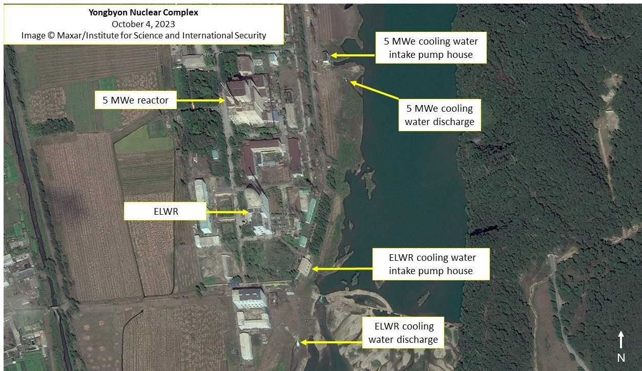
Figure 1. A significant amount of water discharge from the ELWR was first visible publicly in early October 2023 commercial satellite imagery and has been visible regularly since.

While the water outflow is consistently visible, the amount of outflowing water does not appear to have been consistent in volume, with some dates showing water gushing out of the discharge point in a wide stream, and others showing a thinner stream, albeit still significant. The widest water stream was noted on December 10, 2023 (see Figure 2). Imagery from just ten days later on December 20, 2023, shows an outflow that is half as wide.